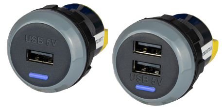
PowerVerter PV65R-S and PV65R-D single and double outlets.