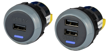
PowerVerter PV65R-S and PV65R-D single and double outlets.