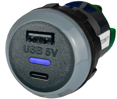
PR65R-AC, standard fit AC USB charger secured into place with locking nut.

The PR65R range of chargers are manufactured using rugged components to provide years of service in demanding commercial environments and are covered by a three year return to base guarantee.