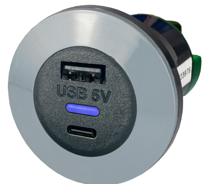
PR65R-ACFf, front fitting version can be screwed in place from the front, then covered with the attractive ring to avoid tampering.