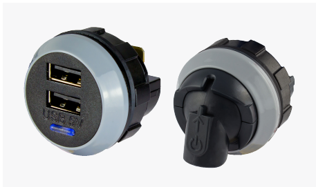
PowerVerter USB PVPro-D and PVPro-L

Achieving the correct ambient lighting in buses and coaches while driving at night can be a challenge. Some passengers may wish to rest, others might like to read or check and update mobile devices. This causes the dilemma: lights on or off? At night, typically lights are dimmed and passengers can choose a private reading light, illuminating their surroundings, usually situated in the ceiling of the vehicle. However, to reach from the ceiling, such lights need to be quite bright. This can cause annoyance to nearby passengers, as well as a significant rear view distraction to the driver as lights flash on and off.