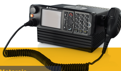
Motorola MTM800 TETRA