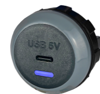
PVPro-C Single output C connector