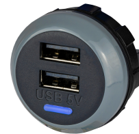
PVPro-AA Double output A connector