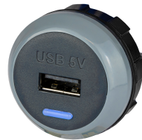
PVPro-A Single output A connector