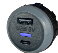
PVPro-AC Dual output A & C connector