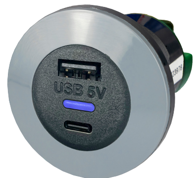
PR65R-ACFf, front fitting version can be screwed in place from the front, then covered with the attractive ring to avoid tampering.