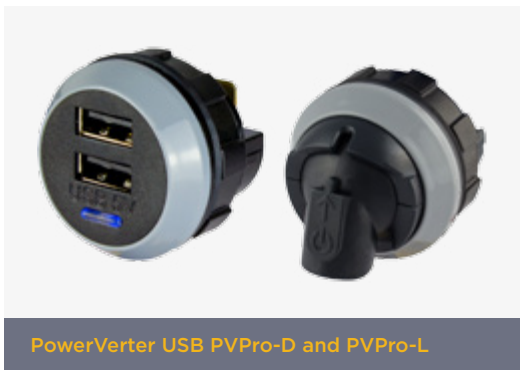
PowerVerter USB PVPro-D and PVPro-L

This causes the dilemma. Lights on or off? At night, typically lights are dimmed and passengers can choose a private reading light, usually situated in the ceiling of the vehicle which then shines on the appropriate seat, illuminating their surroundings. However, to reach from the ceiling, such lights need to be quite bright. This can cause annoyance to nearby passengers, as well as a significant rear view distraction to the driver as lights flash on and off while the vehicle is in motion. The Alfatronix PVPro-L reading light offers the ideal solution. It can be installed in the back of the seat in front. The light ray can be directed to the left or right as well as forward or backwards for discreet, yet maximum comfort for both the user and their neighbours.