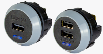
PowerVerter USB PVPro-S and PVPro-D single and double outputs