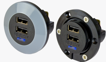
PVPro-DFf, front fitting version can be screwed in place from the front, then covered with attractive ring to avoid tampering.